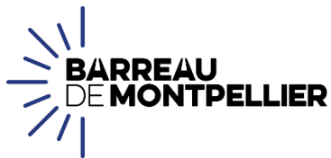
Barreau de Montpellier