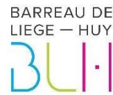
Barreau de Liège-Huy