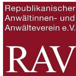
Republikanischer Anwältinnen- und Anwälteverein e.V. (RAV)