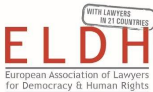
European Association of Lawyers for Democracy & Human Rights