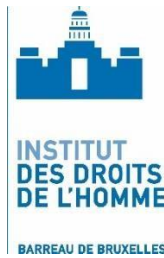
Institut des droits de l'Homme du Barreau de BRUXELLES