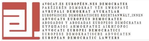
AED - European Democratic Lawyers