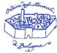
Ordine degli Avvocati di Bologna