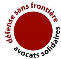
Défense sans frontières – Avocats solidaires