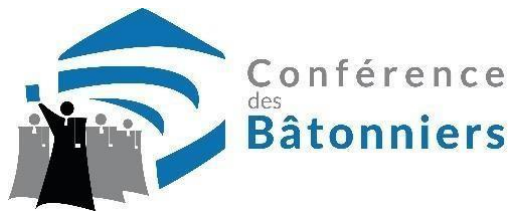
Conférence des bâtonniers de France