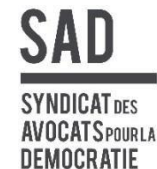
Syndicat des Avocats pour la Démocratie