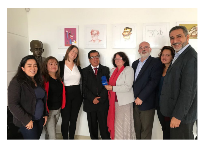
Lawyers from CCAJAR with delegates and the press in Bogota

Despite the signing of the Peace Agreement with the FARC, a number of other illegal armed groups remain active in Colombia, such as the National Liberation Army ( Ejército de Liberación Nacional - ELN), Popular Liberation Army ( Ejército Popular de Liberación - EPL) and Gaitanista Self-defence Forces of Colombia ( Autodefensas Gaitanistas de Colombia ).