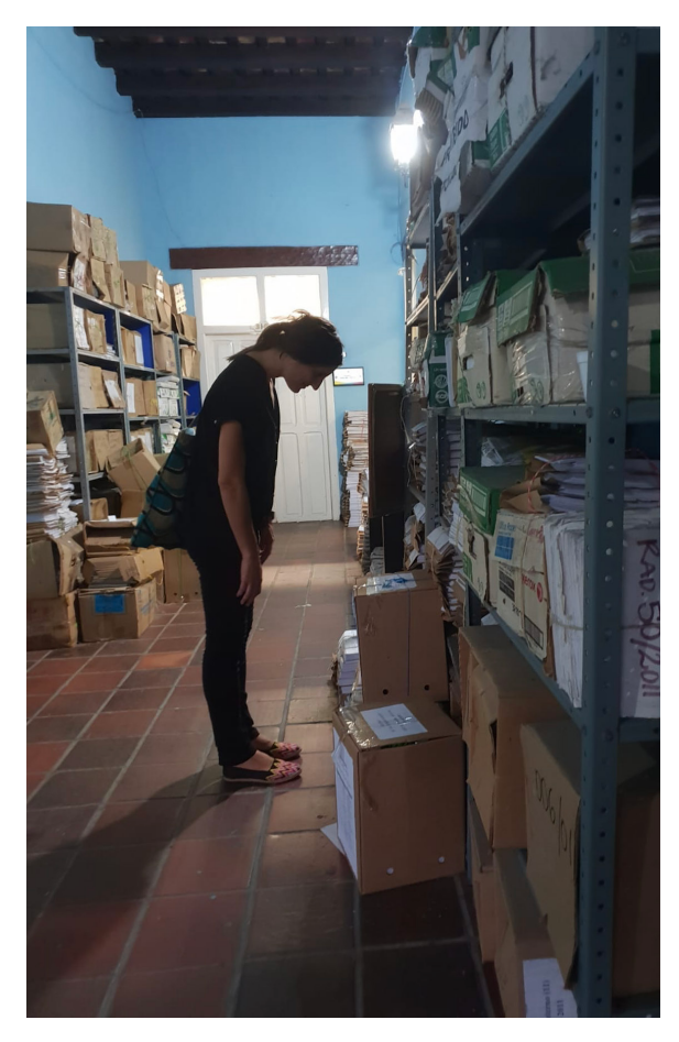
Delegate observing confidential case files stored in the corridors of Courts of El Cartel Fijo , accessible to the general public, Cartagena

The Caravana heard, during their meeting with the Asonal Judicial, that since 1974, the building has undergone numerous repairs highlighting concerns with the lifts and yet the conditions in the court building have continued to be unsafe for lawyers and judges to work in. The lifts had allegedly been faulty for years with more than thirty incidents reported since 2014 that authorities have failed to resolve; the ongoing delay in identifying an alternative court building gives the impression that ensuring a functioning court process is not a high priority to the authorities. As a result, the judges have gone on strike bringing access to justice to a halt.