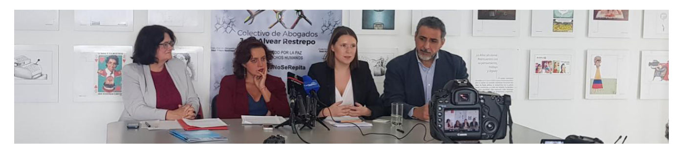
Delegates from the UK, Italy, and Mexico present initial findings at a press conference in Bogota, on their return from visiting six regions of Colombia

The situation of human rights defenders and people's ability to exercise the fundamental freedoms of expression and assembly has been further impacted by the criminalisation of protest with changes to the police code and protocols on protest. It has been suggested that these changes aim to restrict protest <sup>57</sup> by social movements. Delegates understand that serious criminal charges are being used in an attempt to deter protesters, for example, some of the charges levied against protesters carry up to 28 years imprisonment.