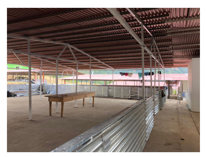
Concentration zone in Monte Redondo, Valle del Cauca

ex-combatants have not been released from prison despite amnesty provisions in the Peace Agreement and delegates were told that FARC ex-combatants have been victims of falsified charges of belonging to a dissident group and, consequently, imprisoned. Parts of Antioquia are dominated by the drugs trade and were formerly occupied by the FARC. Following the Peace Agreement, areas have been taken over by Los Gaitanistas, Los Caparabos, y Los Grupos Pacheli (who belong to La Oficina del Valle del Urra), and dissident FARC combatants.