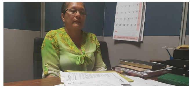
Victim of forced displacement swamped in paperwork, Cartagena

The Caravana met with a farmer who had been forcibly displaced from Montes de María with her husband, unable to return to their land. She explained that they used to own a rich land and had a prosperous future but now they are homeless in Cartagena. She showed the various documents she had filed to claim compensation as a victim and seemed confused by the lengthy and complicated process she had to go through to be recognised as a victim and to be able to receive compensation from the state. Even though she has a lawyer, she was uncertain of which stage of the process she has reached and her case, showing how the system presents many difficulties for victims