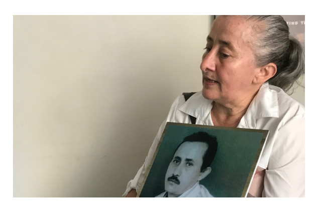
Family member of victim of 'false positive' killings with photo of their loved one.

The Caravana met with family members who have waited years for justice for the extra-judicial execution of