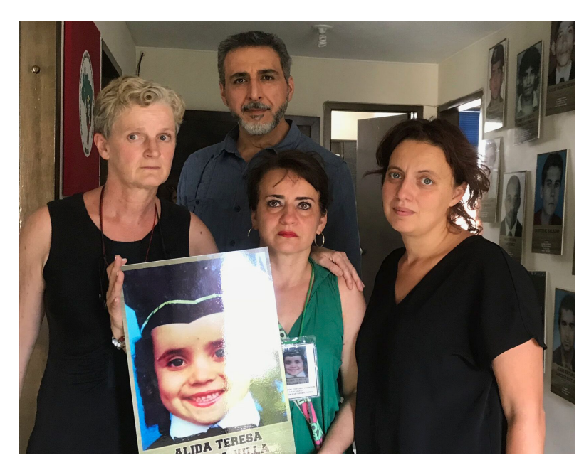
Family member of victim holds a photo of their loved one, alongisde delegates.

Concerns were raised to the Caravana about the availability of resources for victims who need to travel long distances to participate in the process. This should be carefully considered when looking at budgets, resources, and the implementation of JEP processes.