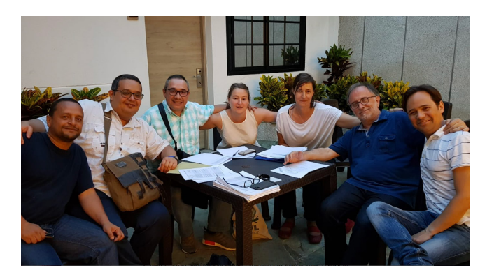
Delegates meeting regional hosts in Medellin

In Cali, delegates heard of the struggle lawyers face to develop an overarching membership body, akin to a Law Society or Bar Association, to dignify the profession, increase solidarity among lawyers, and introduce a Code of Ethics to ensure lawyers are not unjustly associated with clients. It was felt that this structural improvement could help deal with aspects of corruption in the legal system.