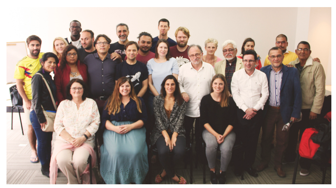
{\sf Delegates\ with\ Colombian\ lawyers\ at\ the\ closing\ session\ of\ the\ International\ Caravana\ in\ Bogota}

The International Caravana of Jurists is the embodiment of the international legal community's concern and solidarity with human rights lawyers and other human rights defenders in Colombia.