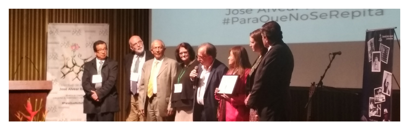
Caravana delegates from the UK and Spain presenting an award in recognition of 40 years of CCAJAR at their anniversary celebrations, in Bogota

Delegates heard how lawyers across the country deem international monitoring and solidarity of great importance to encourage the government to take meaningful action to ensure the safety of human rights defenders. The International Caravana coincided with the 40th anniversary celebrations of CCAJAR. CCAJAR members reiterated the importance of the international community's support. When a delegate asked a senior lawyer of CCAJAR how he could tell the work of the International Caravana and the wider global community is effective he said "the proof is that I am still alive, which probably would not be the case without the Caravana." <sup>78</sup>